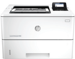
HP LaserJet Enterprise M506dn