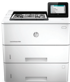
HP LaserJet Enterprise M506x