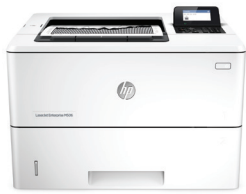
HP LaserJet Enterprise M506n

Finish key tasks faster with a printer that starts right away and helps conserve energy. 1 Multi-level device security helps protect from threats. 6 Original HP Toner cartridges with JetIntelligence and this printer produce more high-quality pages. 2