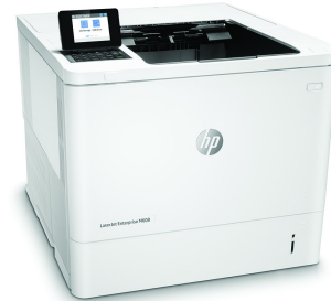
HP LaserJet Enterprise M608dn