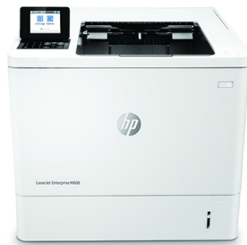
HP LaserJet Enterprise M608n

This HP LaserJet Printer with JetIntelligence combines exceptional performance and energy efficiency with professional-quality documents right when you need them – all while protecting your network from attacks with the industry's deepest security 1